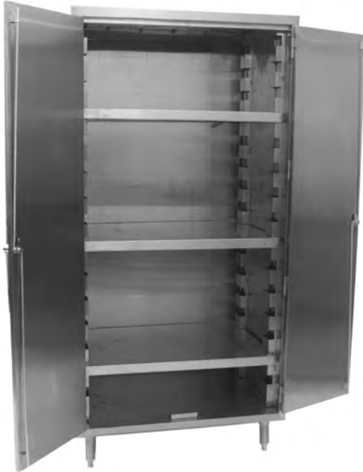
#VSC2436-3 vertical storage cabinet

All stainless steel type 430 enclosed cabinet. Three adjustable shelves on 4" centers, 24"-deep by 36"- or 48"-long. Available with slanted top for laminar flow.