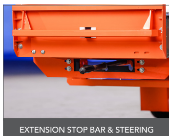
EXTENSION STOP BAR & STEERING

Technical Support Installation & Service Preventative & Routine Maintenance Application Support Operator & Maintenance Training