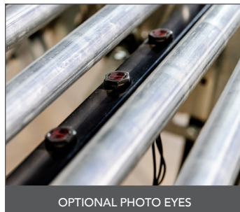
OPTIONAL PHOTO EYES