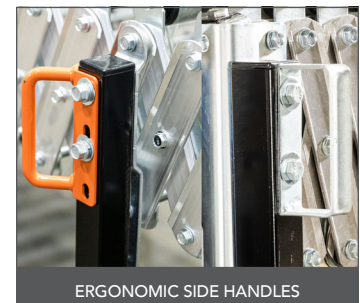
ERGONOMIC SIDE HANDLES