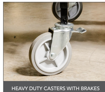
HEAVY DUTY CASTERS WITH BRAKES