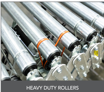
HEAVY DUTY ROLLERS

Technical Support Installation & Setup Service Maintenance Application Support Hardware Support