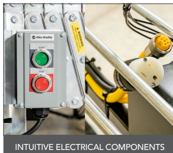
INTUITIVE ELECTRICAL COMPONENTS