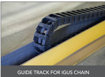
GUIDE TRACK FOR IGUS CHAIN