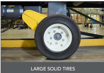
LARGE SOLID TIRES