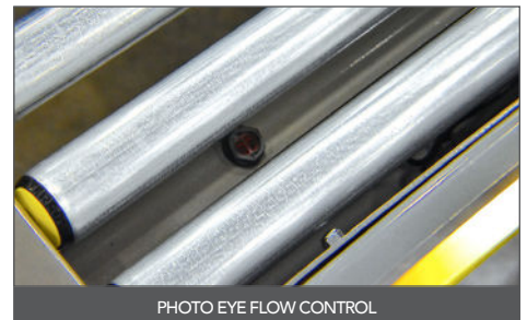
PHOTO EYE FLOW CONTROL