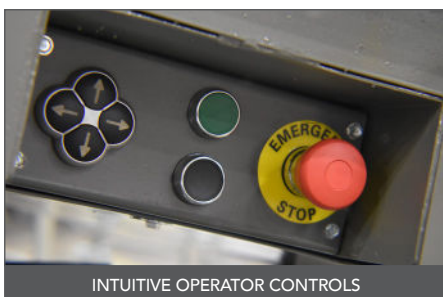
INTUITIVE OPERATOR CONTROLS