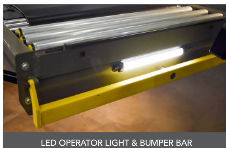
LED OPERATOR LIGHT & BUMPER BAR