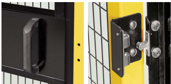
Standard doors include pull handle and built-in door catch.