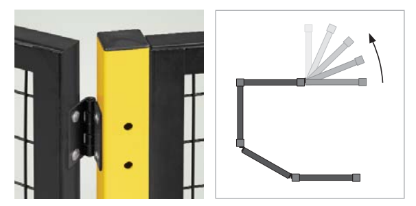
Angle panel kit lets you position panels in just about any configuration you like, from 0 to 90 degrees.