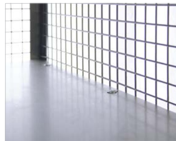
Shelves can be added to make the most of your storage space