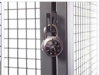
All Dispatcher Lockers come with a padlock hasp for increased security