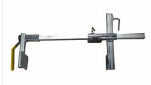
Tool Free Perimeter Clamp