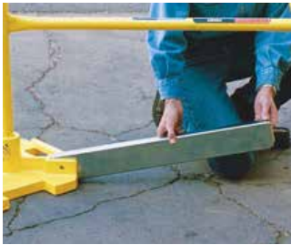
Adjustable Toe Boards