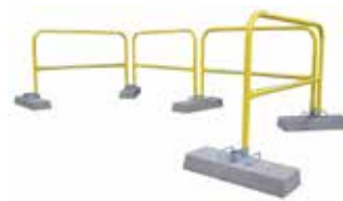
Set and Prevent™ RailGuard 200 Base