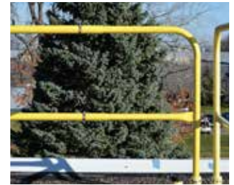
Adjustable Rail Sections