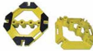
Optional Base With Pads