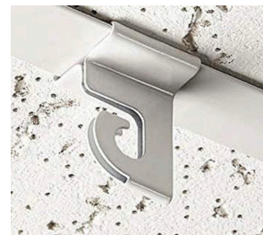
Drop ceiling mount included.