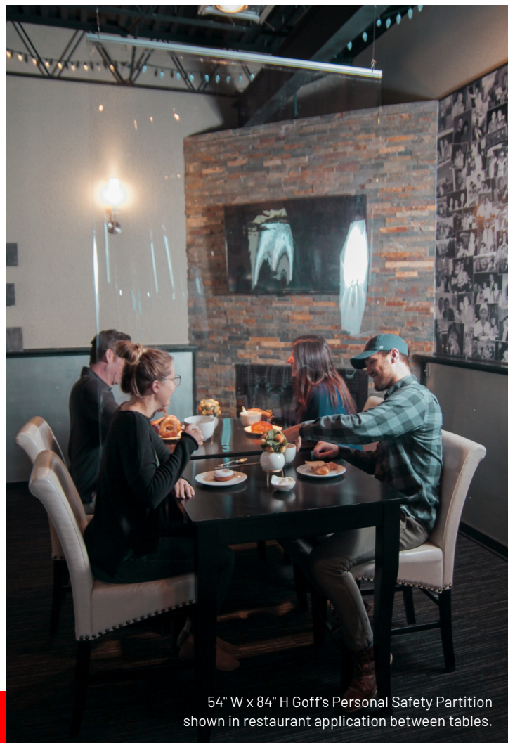
54" W x 84" H Goff's Personal Safety Partition shown in restaurant application between tables.

Our food-grade PVC is antimicrobial, meets USDA guidelines, and NFPA 701 fire resistance standards, making it safe to use anywhere in your facility.