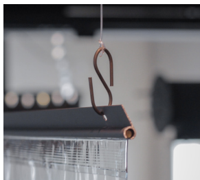
S-hooks mount to top rail, or use holes to mount to ceiling.

Our quick turnaround time & multiple included mounting options ensure you can get your partition installed and keep your space safe and clean in a matter of days.