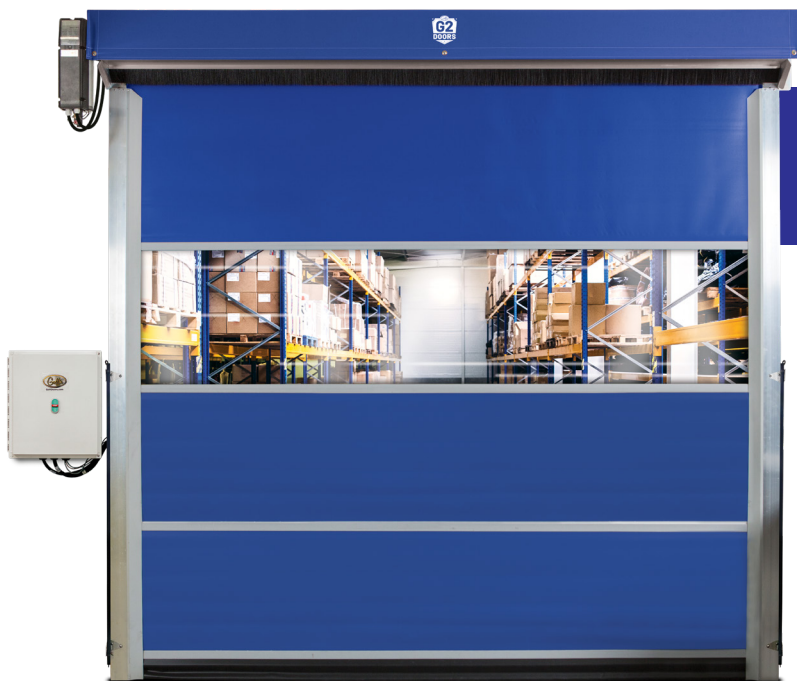
10'x10' door with red, vision, gray, and blue replaceable panels.

Our G2 high performance doors are available with the options you want and the reliability you need for your facility. Whether you are looking for a high speed door fully integrated with your building's safety systems, or simply a reliable door to separate your spaces, G2 doors minimize downtime and maximize profitability in your facility.