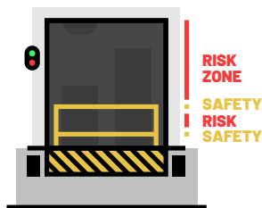
Dock Gate System