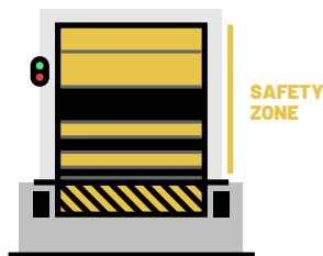
Fall Guard Safety System

While the other guys aim to check the OSHA box, they create additional risk by allowing falls over or through their "barrier." Fall Guard creates a complete safety zone covering the entire opening of your loading dock, ensuring maximum safety while minimizing risk at your facility.