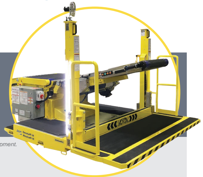
Image includes optional equipment.

Increase Productivity. Improve Safety. Promote Ergonomics.