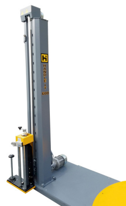
Powered carriage tower with photo eye