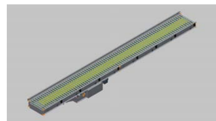
Conveyor shown in Standard Gray.