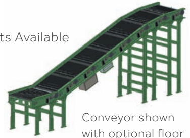
Conveyor shown with optional floor supports.