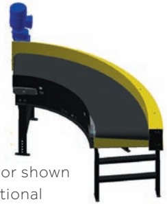
Conveyor shown with optional floor supports.