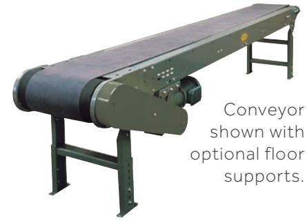
Conveyor shown with optional floor supports.