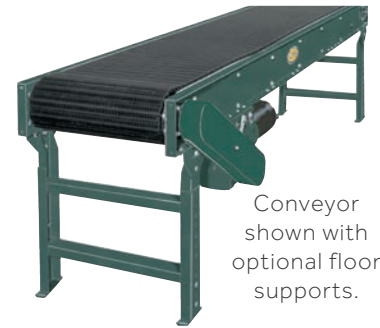
Conveyor shown with optional floor supports.