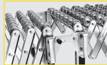
Leg Connect Brackets

LEG CONNECT BRACKETS – Connecting two or more conveyors.