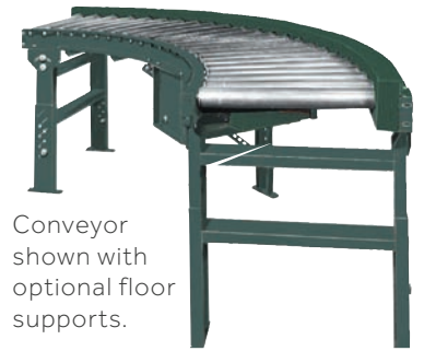
Conveyor shown with optional floor supports.