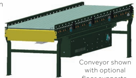
Conveyor shown with optional floor supports.