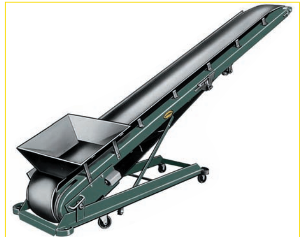
Troughing attachment with hopper