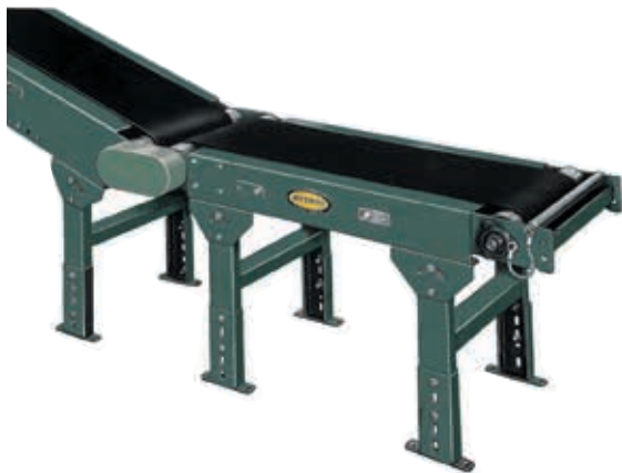
SHOWN WITH OPTIONAL LOWER POWERED FEEDER AND SUPPORTS

FLOOR SUPPORTS —Now supplied as optional equipment.