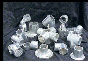
Master Distributor of Hollaender Fittings