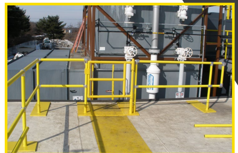
Locking Steel Pipe & Plastic Gates