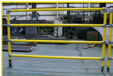
Custom Rail Design available