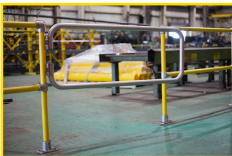
Self-Closing Aluminum Swing Gates