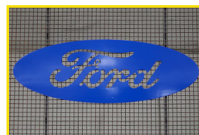
Custom Cut Infill Panels