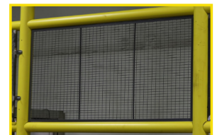
Protective Cage Infill Panels