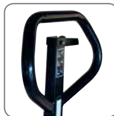
Ergonomic handle ensures the user a relaxed hold.