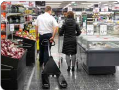
Panther Silent in a supermarket, where comfort and well-being of the customer are vital.