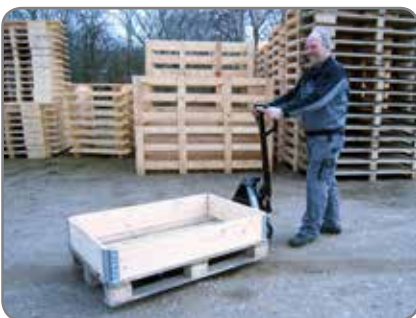
Panther Silent also manages outdoor transport. Metallic chips, small stones and snow do not get stuck to the wheels.