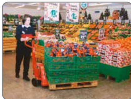
Adjustable fork height - no problems when handling low and worn pallets.