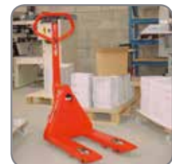
Panther is available with different fork lengths.