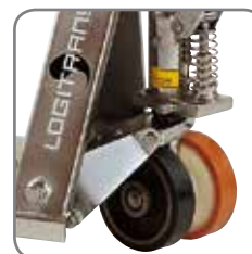
Different wheel types, to suit the needs of the user.