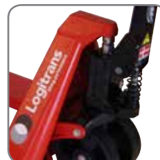
Permanent quick lift.