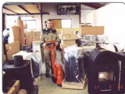
An easy handling of goods is ensured even in very confined spaces.