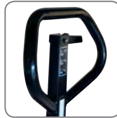
Ergonomic handle ensures the user a relaxed hold. Can be marked with name/department.

Stainless and explosion proof pallet trucks are also available.