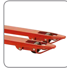
The hoop skates on the forks ensure an easy fork insertion and withdrawal in/out of pallets.