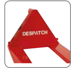
The company name or logo can be cut out in the triangle of the Panther.