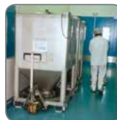
The pallet truck being used in the pharmaceutical industry.