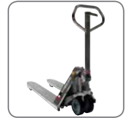
The pallet truck is also available with different wheels.