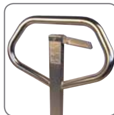
Ergonomic handle ensures the user a relaxed hold.