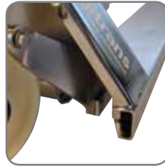
Completely open or completely closed truck elements facilitate efficient cleaning.