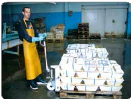
Inox - for the food industry in areas, where hygiene demands are not so high, but corrosion resistance important.