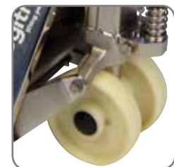
Wheels with rubber-sealed bearings.