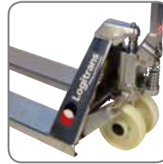
The lowered height can be adjusted.