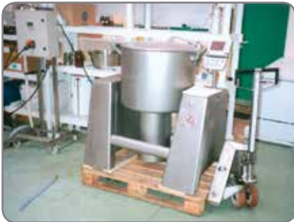
Inox Plus - for the food industry and the pharmaceutical industry with strict hygiene and sanitation requirements.