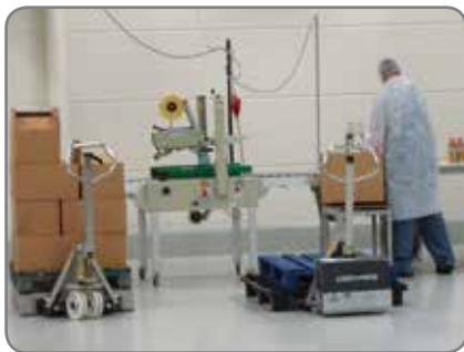
RF-PLUS - for the food industry and the pharmaceutical industry with severe demands for hygiene and cleaning.

* The capacity changes from 3300 to 2200 lbs. at the lifting height 18.5".