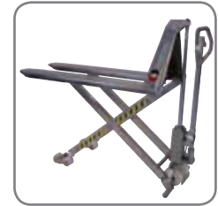
The stainless Thork-Lift is available in electric and manual versions.