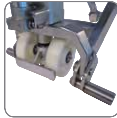
Optimum safety through supporting feet at steering wheel, foot protection and central location of all control buttons on the handle.

EHL RF-SEMI: Stainless handle, axles and wheel holder. All other parts have a polymer plastic coating or are chromit-treated. Battery indicator extra painted.