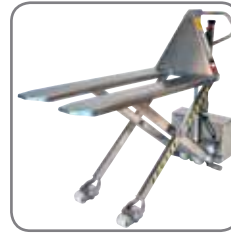
Closed forks mean easy cleaning and few hiding places for bacteria.