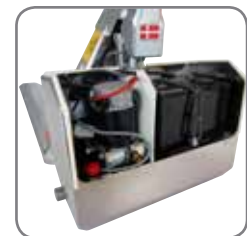
Watertight casing of the lifting motor (EHL RF-PLUS).