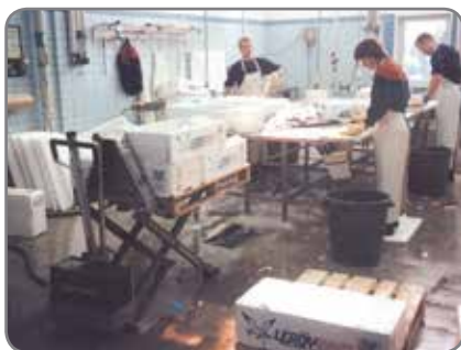
RF-SEMI - for the food industry in areas, where hygiene demands are not so high, but corrosion resistance important.