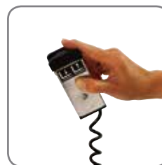
Remote control is available as optional extra (EHL).