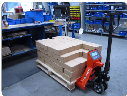
The BFC6-7 transports and weighs goods in the same work procedure.