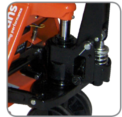
Reliable leak-proof hydraulic system.