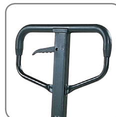
Rubber covered handle ensures a comfortable hold.