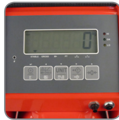
The BFC6-7 has tare and zero setting, and can show kg or lb.