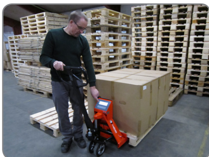
The ideal weighing system – solid, accurate and easy to use all over the company!