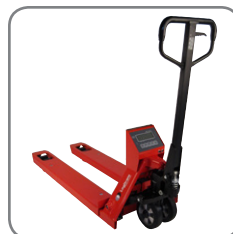
Accurate weighing results with four built-in weighing cells.