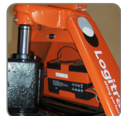
Built-in charger with an easily accessible charger plug.

Please ask for further information or visit our website www.interthor.com