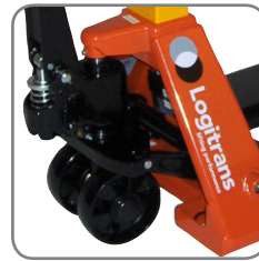
The turning angle of BFC6-7 is 210°, ensuring easy operations in confined areas.