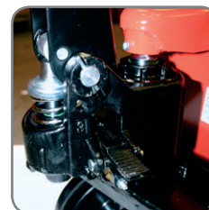
Reliable leak-proof hydraulic system.