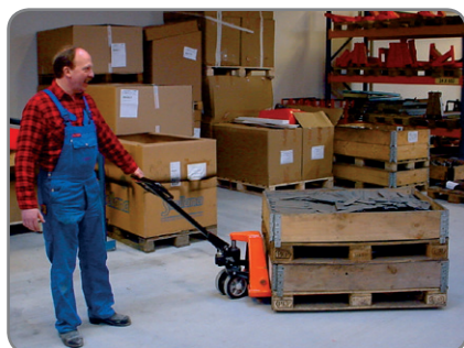
The ETT pallet truck transports components between work stations in the component industry.