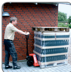
The ETT shown being used moving a pallet of beer bottles.