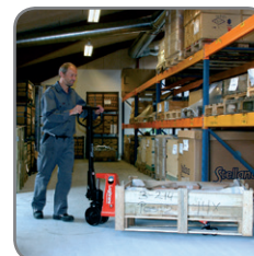
The ETT ensures an optimum utilisation of space in storage areas.

Please ask for further information or visit our website www.interthor.com