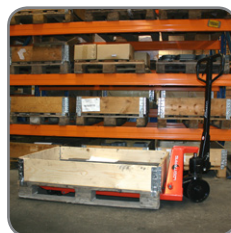
The ETT pallet truck shown being used in the component industry moving heavy goods.