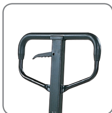
Rubber covered handle ensures a comfortable hold.