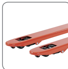
Available with single or tandem fork wheels.