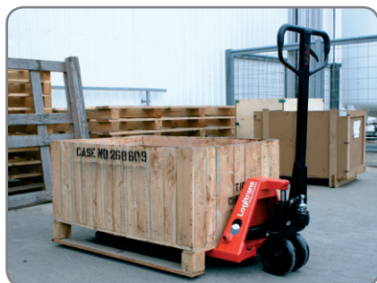
The ETT pallet truck moves material in the packaging industry.