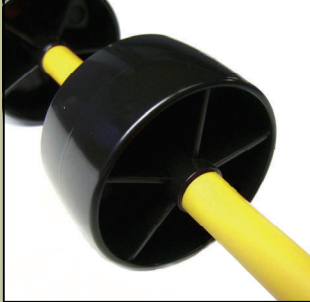
Large 1.9" diameter X 1" wide rollers

Skatewheel style carton flow ... the most flexible carton flow available