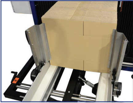
Blank Delivery Control Powered belts precisely govern the delivery speed of the case blanks. Blank retainers ensure the blanks are spaced correctly.