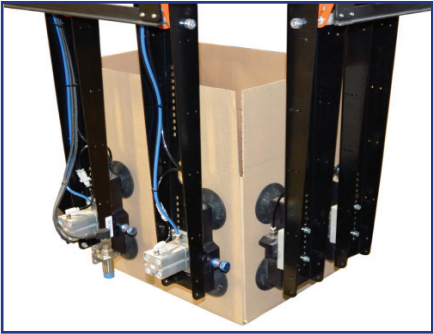
Square Case Erecting Eight vacuum powered suction cups hold the blank in the correct position after it leaves the magazine. Both leading panels are held securely.