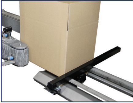
Square Case Transition A pusher bar, parallel to the rear wall of the case, pushes it into the sealing section where spring-loaded side belts automatically adjust for any width variations.