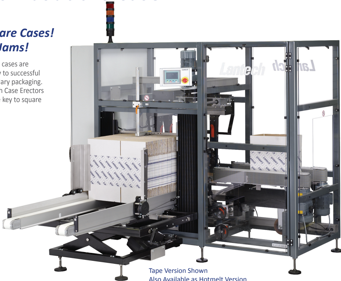
Tape Version Shown Also Available as Hotmelt Version

Square cases are the key to successful secondary packaging. Lantech Case Erectors are the key to square cases.