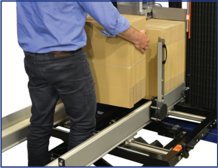
Ergonomic Blank Loading Easy to load magazine. Replenish blanks while machine operates. Simple and fast magazine adjustments.