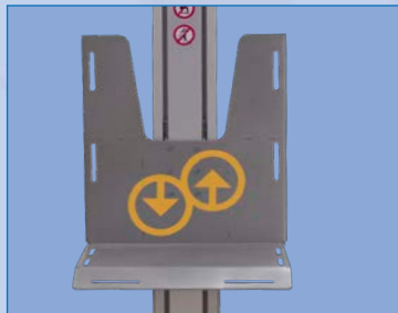
Platform slots for securing loads with bungees or straps.