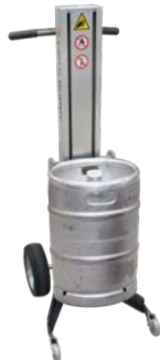
Lift'n Buddy Keg Lifter