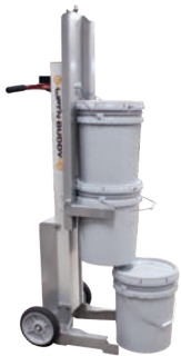
Lift'n Buddy Pail Lifter