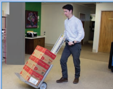
As simple to use as any 2-wheel hand truck.