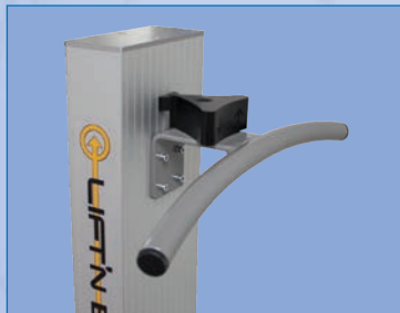
Ergonomic handle with lifting and lowering thumb switch.