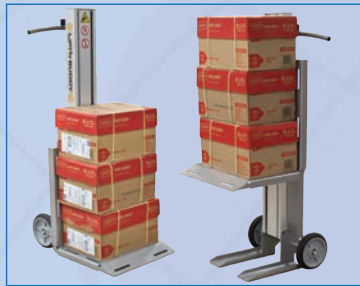
Base legs allow the LNB-2 stand even when loaded and raised.