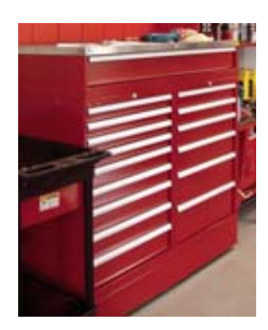
Lista created a custom toolbox for service technicians at United Auto Group dealerships. The cabinet combination includes a Double Width cabinet mounted over two Standard Width cabinets, and a special "skirt" to hide the mobile base.