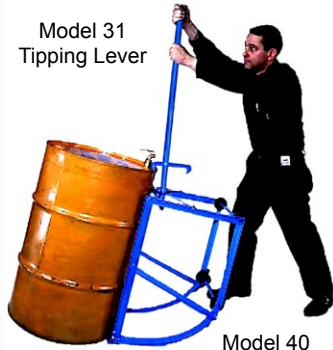
Model 40 Drum Cradle