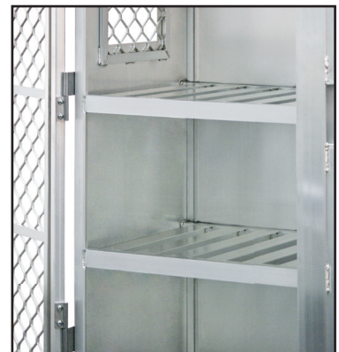
Interior T-Bar Shelves

This information is for general sales and engineering use only. New Age Industrial reserves the right to modify or make changes at any time without notice to materials and specifications.