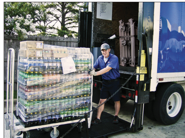
Big enough to transport enough product to stock a complete area, this folding delivery truck allows quick, convenient stocking.