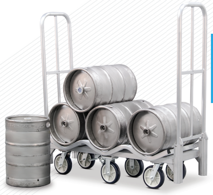
51753 Holds up to 6, 15.5 Gallon, Half-Barrel Kegs shown with BDT18568B

All welded keg carriers nest securely on our BDT Trucks for safe, keg transport.