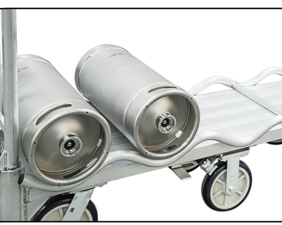
52064 | Holds up to 15, Sixth -Barrel Kegs