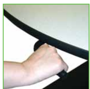
Add-on push handles