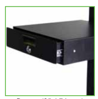
Drawer (3" / 76 mm) Part No. B128