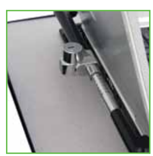
Laptop security bracket Part No. B114