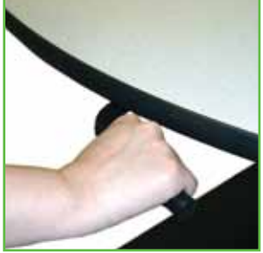
Part No. B138