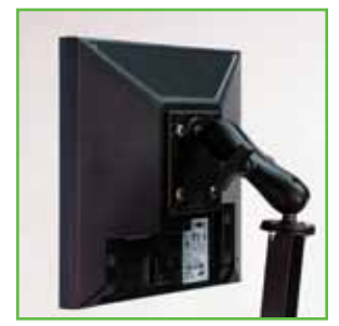
LCD support Part No. B118