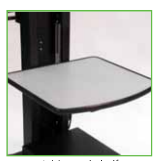
Additional shelf Part No. B124