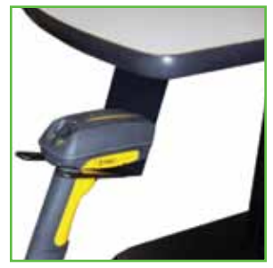
Scanner holder Part No. B132