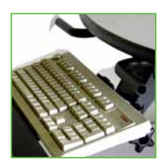
Adjustable keyboard tray Part No. B100