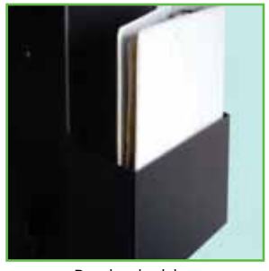
Binder holder Part No. B122