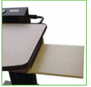
Slide-out shelf Part No. B126

Newcastle Systems' line of NB Series accessories can be integrated in seconds to create a highly functional mobile workstation that is customized to your specific application. Accessories include: