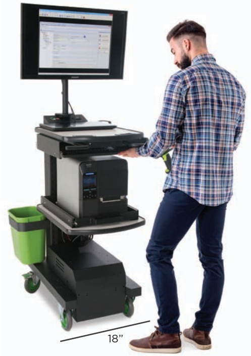
NB Series SLIM shown above with optional second shelf, slide-out printer tray, post-mounted flat screen holder and keyboard tray

All NB Series Mobile Powered Workstations listed below come standard with (one) adjustable height shelf, 5" locking casters, front push handles, integrated power system and power strip, wastebasket and holder.