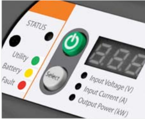
Remote battery/inverter status meter

With the largest range of accessories, the NB Series can accommodate almost any profile of workstation including those with scales, testing equipment, large monitors, barcode printers and even laser printers. At the end of use, simply plug your cart into a standard wall outlet to recharge.