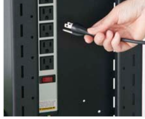
Integrated power strip