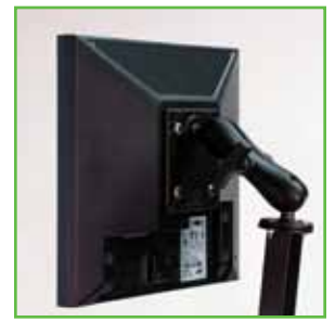
LCD support for NB & PC Series