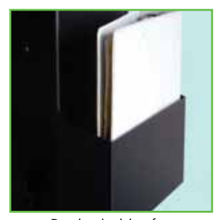
Binder holder for NB & PC Series