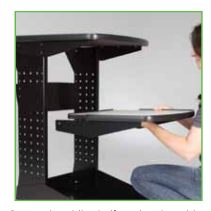
Optional middle shelf easily adjustable