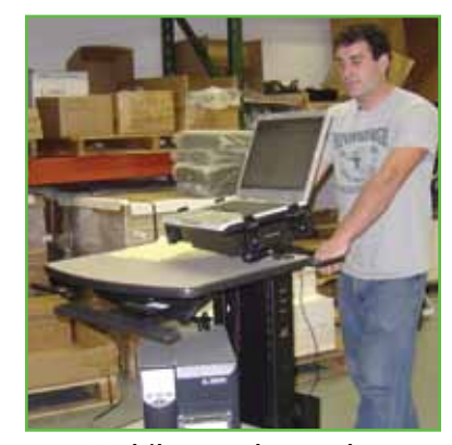
Mobile "on-demand" label printing station