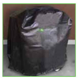
Cart cover for NB, PC & RC Series