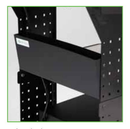
Standard storage compartment

Modular – A number of optional accessories are available and can be easily integrated in seconds to create a highly versatile workstation. (See page 8)