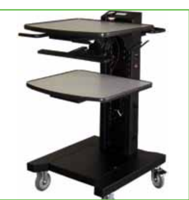
NB300 non-powered version with optional accessories