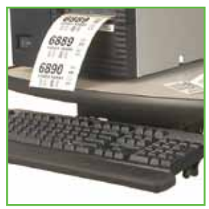
Adjustable keyboard tray for NB & RC Series