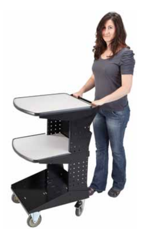
RC200 non-powered version with optional middle shelf