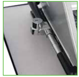
Laptop security bracket for NB & RC Series