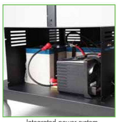
Integrated power system