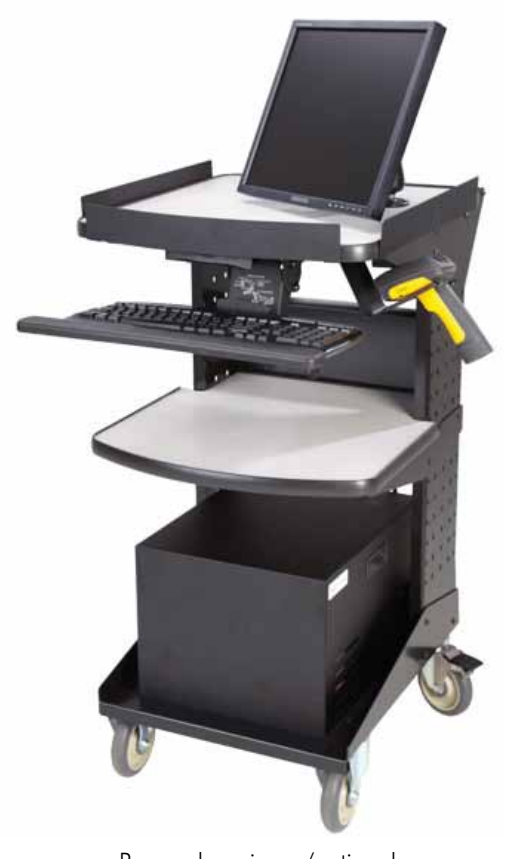
Powered version w/optional middle shelf, keyboard tray, scanner holder, LCD holder and shelf lip