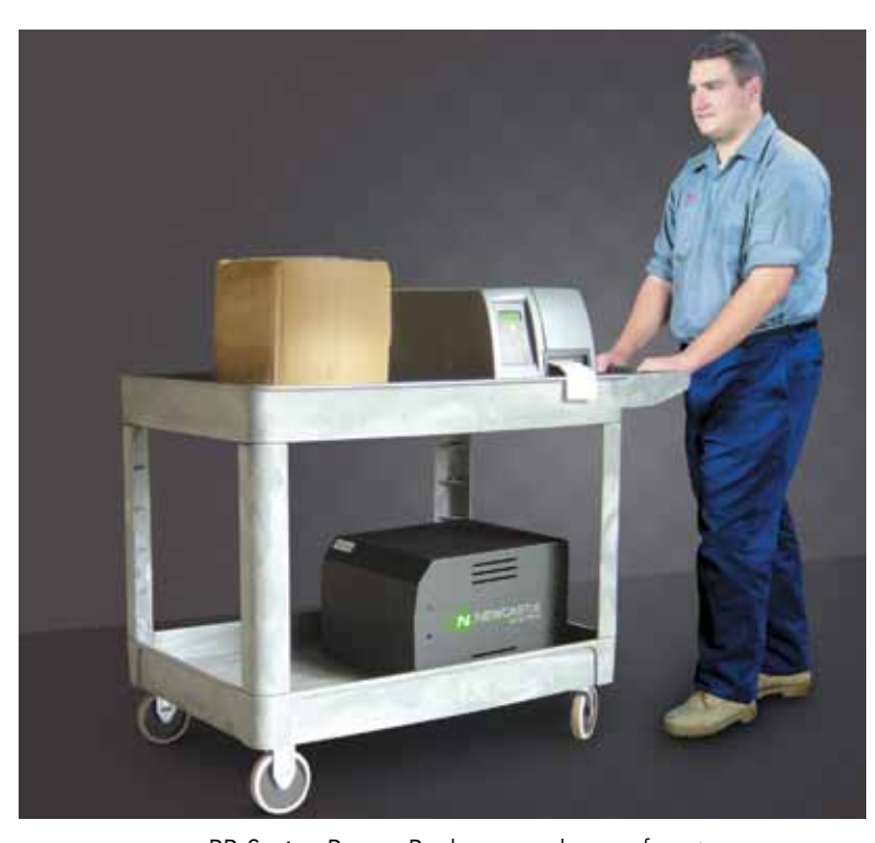
PP Series Power Package on base of cart

The PP Series is also an economical power solution for a non-powered industrial cart (shown below).