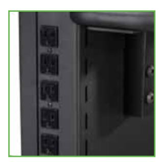
Built-in powerstrip to plug in hardware