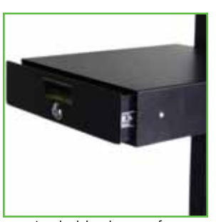
Lockable drawer for NB, PC & RC Series