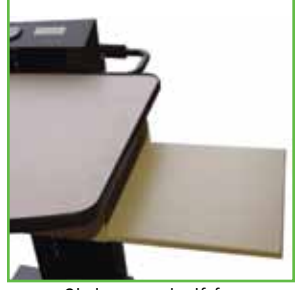
Slide-out shelf for NB & RC Series