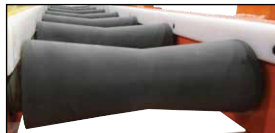
Machined Bow-Tie Profile Millable Urethane Coated Rollers