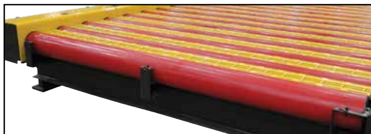
Red Urethane Coated 6" Rollers