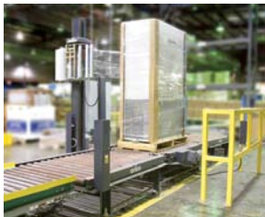
Turntable Automatic System

Orion manufactures two types of automatic stretch wrapping systems; rotary tower for higher speed applications or turntable when footprint size is critical. Both are manufactured for high reliability in even the most extreme conditions.