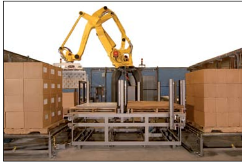
Brenton designs and builds custom robotic case packing and material handling systems.

Brenton, Pro Mach's End-of-Line flagship company, designs and manufactures a wide range of innovative solutions for case packing, shrink wrapping, robotics and palletizing. Skilled and experienced engineers and craftsmen create packaging machinery known for durability, reliability, flexibility and speed. Brenton is a packaging industry leader in servo-technology applications.