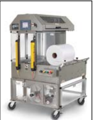
Hand Load Vertical Packager

Rennco leads the way with a full line of vertical bagging systems for products that may be difficult to wrap on other equipment. There are different styles to match your product and can be very cost-effective by eliminating more expensive packaging methods.