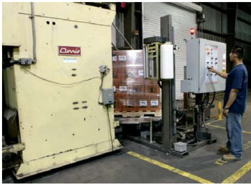
Currie palletizers can easily be mated to an Orion automatic stretch wrapping system.

The Currie line of level conventional palletizers use proven, simple and rugged designs for maximum reliability and value. Many Currie palletizers are still in operation after 40 years of service. Currie offers several product lines including low level and high level infeed palletizers, case elevators, pallet dispensers, slip sheet feeders and complete palletizing systems.