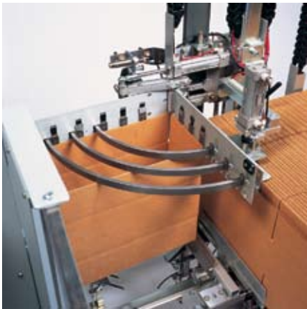
Wexxar Pin and Dome technology outperforms all other forms of case opening technologies.

Wexxar case formers and BEL case sealers offer increased productivity, reduced labor and improved ergonomics in even the most demanding packaging operations. With more than 15 major industry innovations, including the innovative Pin and Dome mechanical case opening technology, Wexxar/BEL creates solutions for any case packing need.