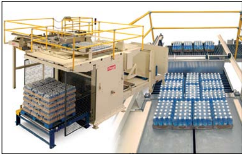
Currie conventional palletizer systems are offered in a variety of configurations to meet virtually every automatic palletizing challenge.

The Currie line of level conventional palletizers use proven, simple and rugged designs for maximum reliability and value. Many Currie palletizers are still in operation after 40 years of service. Currie offers several product lines including low level and high level infeed palletizers, case elevators, pallet dispensers, slip sheet feeders and complete palletizing systems.