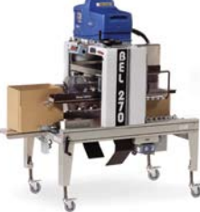
BEL Case Sealer (Glue)

BEL brand case sealers are the industry leader in case sealing technology. BEL case sealing systems come in a variety of models and configurations including tape and hot glue sealers.