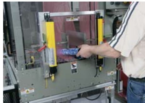
Rennco offers bagging systems that can be loaded manually (above) or via a conveyor system.