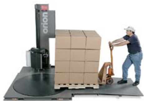
Orion Flex Series stretch wrapping machines set the standard for high performance, value and efficiency. Available in both rotary tower and turntable styles, Flex machines are available in both semi-automatic and portable automatic models.