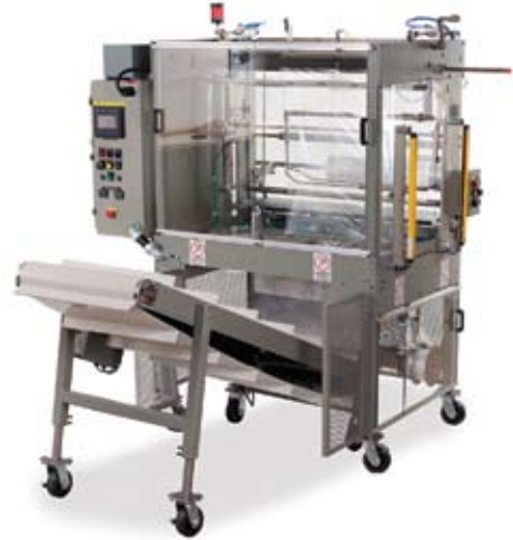
State of the art systems available in multiple sizes customized for each individual application.

Rennco is a market leader in vertical form, fill and seal equipment and offers a wide range of innovative, reliable and cost effective solutions for poly-bagging of products. For more than 35 years, companies have depended on Rennco solutions to package a wide variety of products in center-folded polyethylene, polyolefin and PVC films.