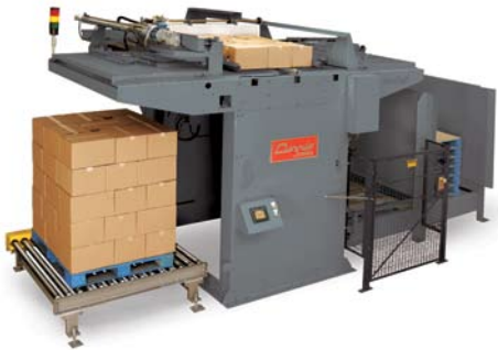
High Level Conventional Palletizer