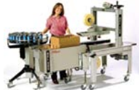
BEL Case Sealer (Tape)

From Pro Mach's Identification & Tracking Business Unit, ID Technology and LSI offer a complete line of labeling, printing, laser and tracking systems to serve your every identification and tracking requirement.