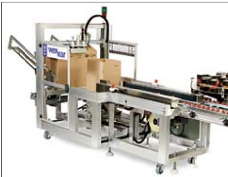
Wexxar/BEL offers a wide range of custom and off-the-shelf case erecting and sealing solutions.

Wexxar case formers and BEL case sealers offer increased productivity, reduced labor and improved ergonomics in even the most demanding packaging operations. With more than 15 major industry innovations, including the innovative Pin and Dome mechanical case opening technology, Wexxar/BEL creates solutions for any case packing need.