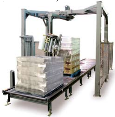
Orion automatic stretch wrapping systems utilize a variety of pallet loads quickly and economically.

Orion Packaging Systems designs and manufactures automatic and semi-automatic stretch wrapping equipment. For over 20 years, Orion has been in the business of protecting customers' products with the highest quality industrial stretch wrapping systems in the industry.