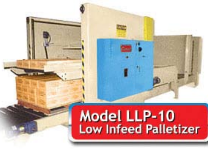
Low Level Conventional Palletizer

Currie by Brenton makes a wide variety of conventional palletizers that fit well in to a range of packaging lines. Design, quality and durability are a long standing tradition with Currie equipment.