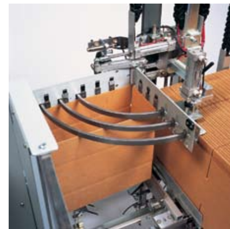
Wexxar Pin and Dome technology outperforms all other forms of case opening technologies.

Wexxar case formers and BEL case sealers offer increased productivity, reduced labor and improved ergonomics in even the most demanding packaging operations. With more than 15 major industry innovations, including the innovative Pin and Dome mechanical case opening technology, Wexxar/BEL creates solutions for any case packing need.