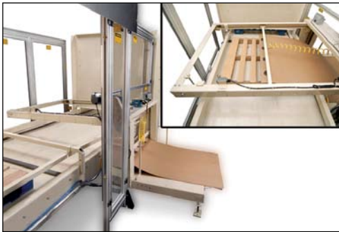
Currie pallet feeding system on high level automatic palletizer.