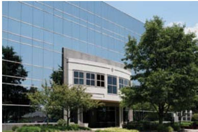
Pro Mach headquarters near Cincinnati, Ohio

Pro Mach provides individual products and solutions as well as complete integrated systems from a wide range of equipment and components designed and manufactured by its divisions, each a leader in their market segments. The combined capabilities and comprehensive range of products provided makes Pro Mach one of the largest and most effective single-source providers of integrated packaging solutions .