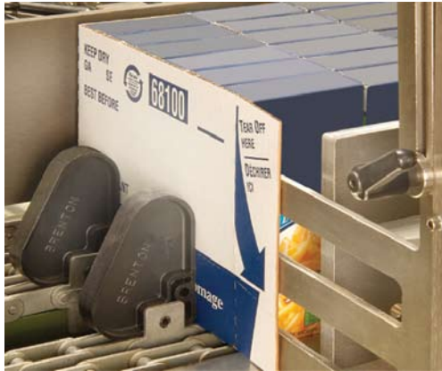
Brenton builds a wide variety of customized case packing applications including: • Wrap-around • Knock-down • Tray packing, Clamshell • Harness Case • Pouch Case • Slotted Case • Retail Ready

Based in Alexandria, Minnesota, Brenton has earned a well-deserved reputation for building the best engineered, most durable and most reliable packaging systems in the industry. They are equipped to handle the most complex of jobs in their newly expanded 150,000 square foot facility which boasts computer water jet cutting, welding and other state-of-the-art manufacturing techniques.