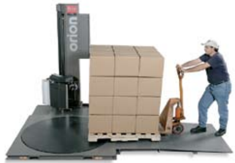
Orion Flex Series stretch wrapping machines set the standard for high performance, value and efficiency. Available in both rotary tower and turntable styles, Flex machines are available in both semi-automatic and portable automatic models.