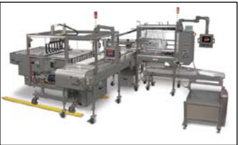
Fully Automated Packaging System

Orion manufactures two types of automatic stretch wrapping systems; rotary tower for higher speed applications or turntable when footprint size is critical. Both are manufactured for high reliability in even the most extreme conditions.