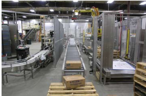
Pro Mach End-of-Line Packaging group designs and manufactures complete packaging lines.