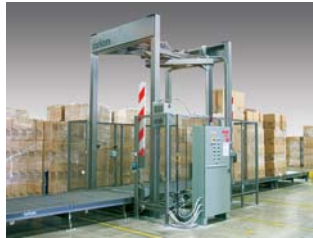
Rotary Tower Automatic System

Currie by Brenton makes a wide variety of conventional palletizers that fit well in to a range of packaging lines. Design, quality and durability are a long standing tradition with Currie equipment.