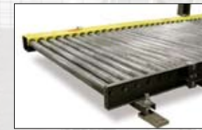
Low Level Conveyor