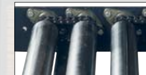
Xtra-Duty conveyor detail