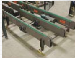
Chain Transfer Conveyor