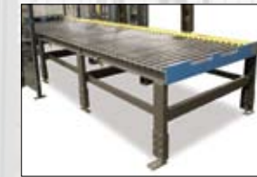
High Level Conveyor