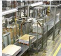
6-Sided Wrapping System