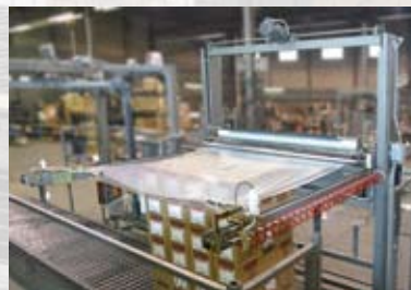
Top Sheet Dispenser (Wrap area model also available)