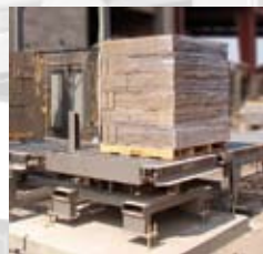
90 Degree Turn Conveyor

Not all options available on all models. Consult your local Orion distributor.