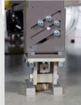
Conveyor Leg Load Cell