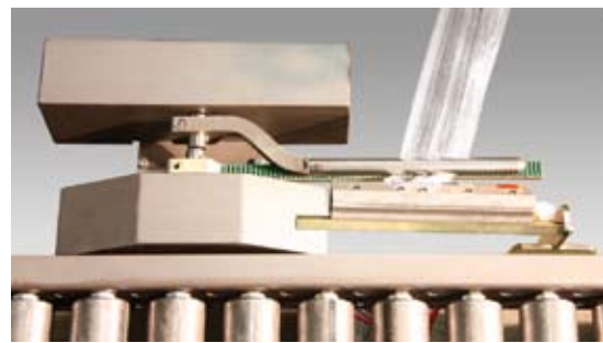
Pneumatically operated film clamp with high grip clamp for reliable grip & release of film tail