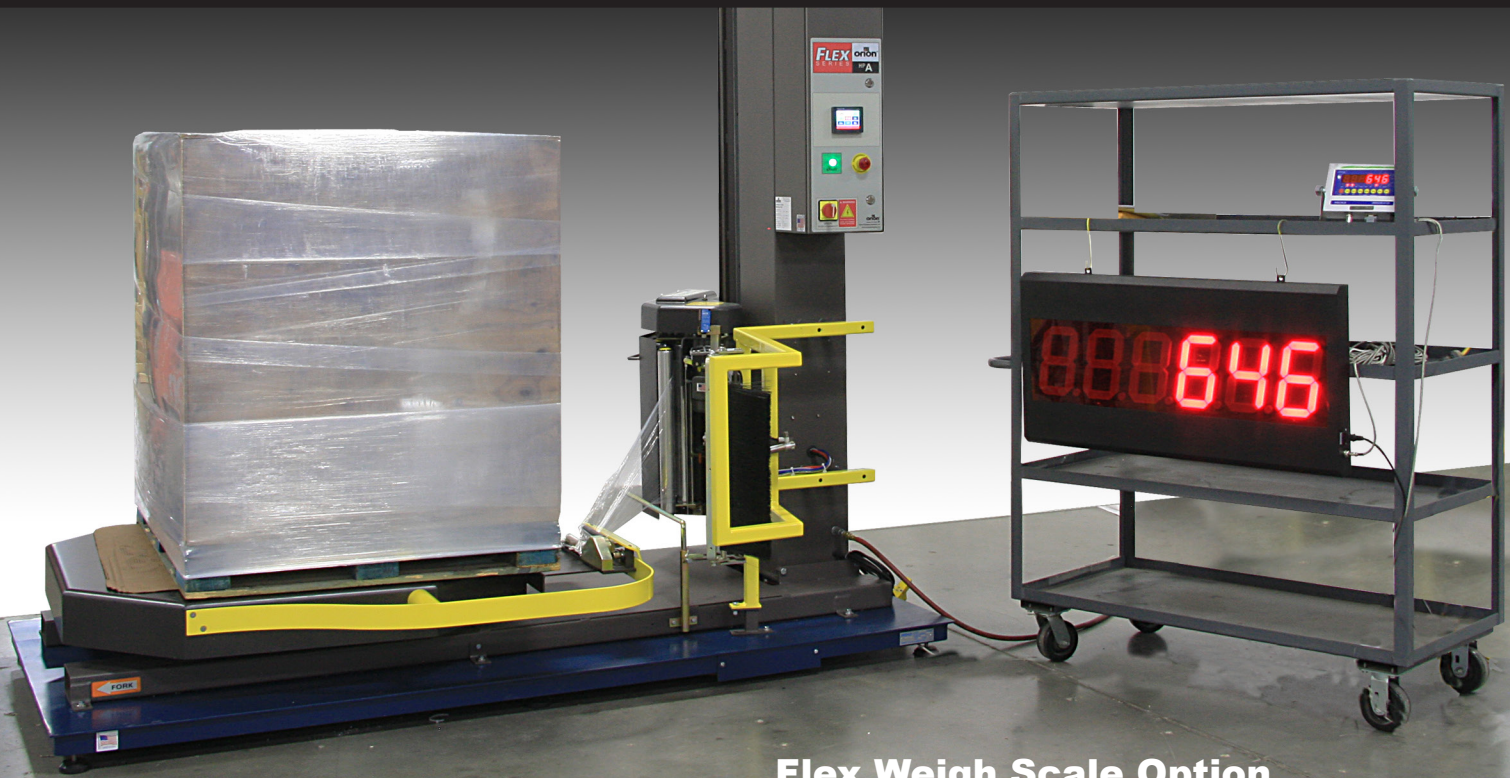
Flex Weigh Scale Option