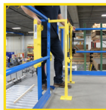
Stand-Off Mounting System