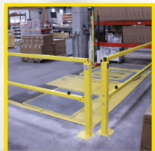
EdgeSafe® Smart Gate