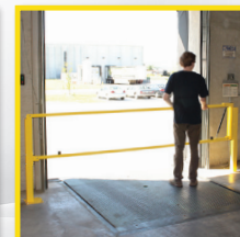
EdgeSafe® Loading Dock Safety Gate