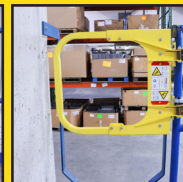
Edgehalt® Posi-Stop Ladder Safety Gate