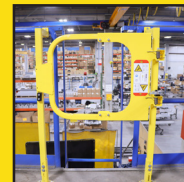
Edgehalt® Ladder Safety Gate