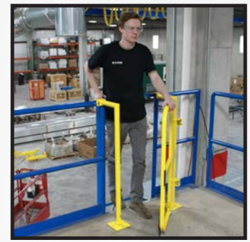
Optional Stand-Off Mounting System shown with Full Height Ladder Safety Gate